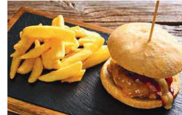
Madero Steak House