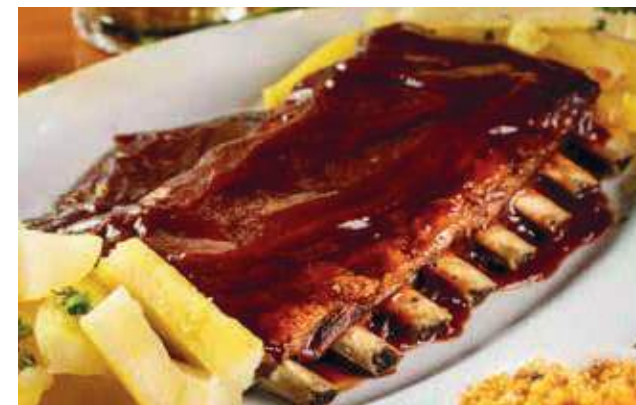
Outback Steak House