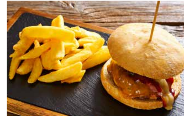
Madero Steak House