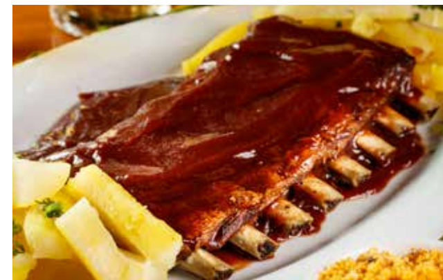
Outback Steak House